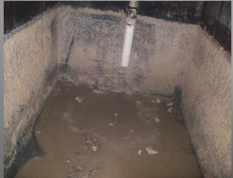
Original Un-cleaned Structure